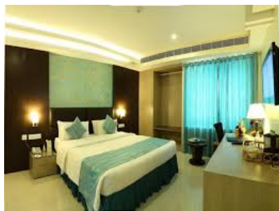
Vihasa Hotel, Tirupati