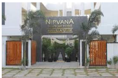
Nirvana Boutique Hotel