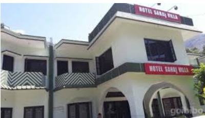
Hotel Sehaj Villa