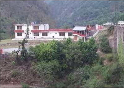
Hotel Durga Resort