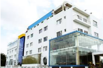
Hotel Rio Grand