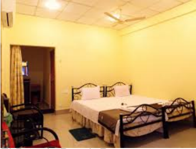
El Dorado Beach Resort