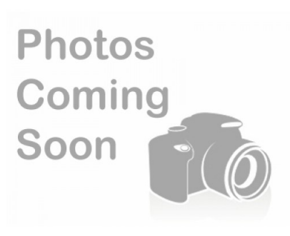
The Eotel Bangkok or Similar