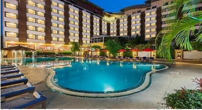
Mountain Beach Resort or Similar